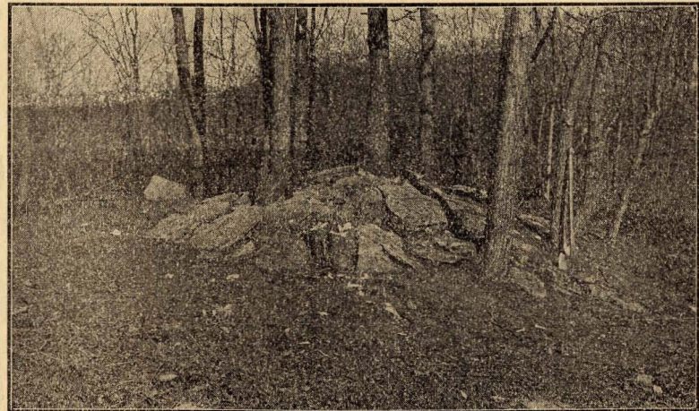
Stone Grave near Aberdeen.