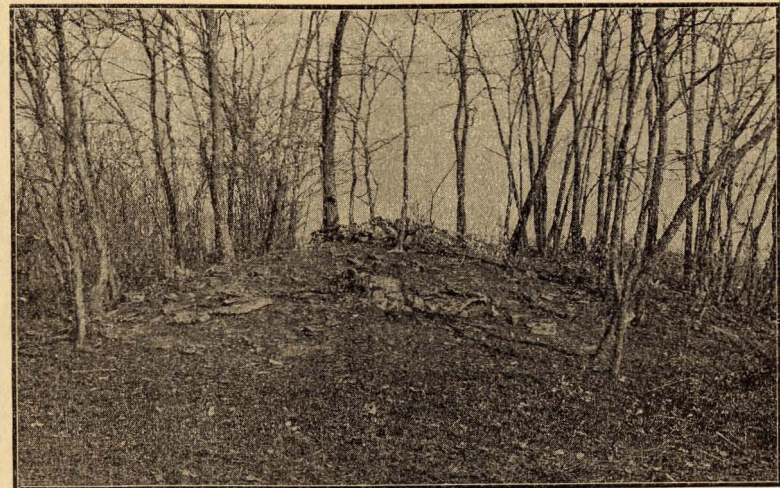
Stone Graves in a Mound of Earth, near Aberdeen.